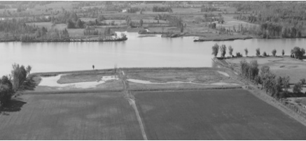
A managed CREP wetland that includes an ART’s component. (Ag drainage that is directed to the wetland)

419-898-1345 7538 W. Stump Rd., Oak Harbor Oh 43449