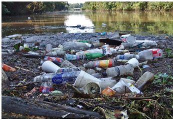
Information provided by Lake Erie Starts Here, a committee of the Toledo Metropolitan Area Council of Governments (TMACOG).

Too wet, too cold, too hot, too dry. Input uncertainty. Crop prices fluctuating. Sounds like a typical farming season in Ottawa County doesn't it? This all adds up to stress for the farmer, their spouse, their family, and can take a toll on a farmers mental wellbeing. The Ohio Department of Agriculture and partners have developed the Ohio Agricultural Mental Health Alliance focusing on mental health in agriculture to ensure Ohio's farmers, families, and communities are better equipped to deal with stress.